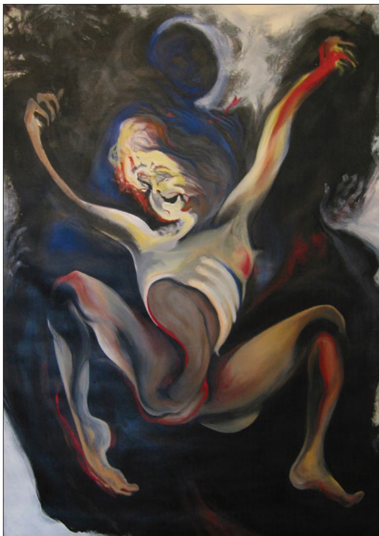
Fig. 2: Lynn Schirmer, “Rite of Passage,” ©1993, acrylic..

f) Humiliation and dehumanization tortures included forced nakedness,