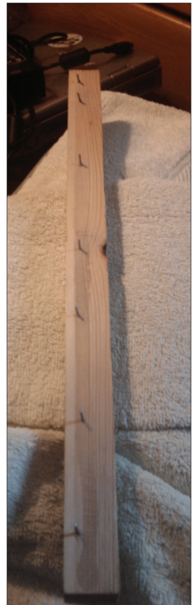
Fig. 1: Bad Stick

They just changed it—when I [was] really small it was a thinner stick etc. [It] got bigger when I got bigger. Pushed into my bum, that was very bad. They had other tools which cut or burned but I only have memories of these, not the actual things.... Rape was always done. Sometimes