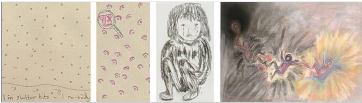
Fig. 4: "Shatter Bits," "Little Goodness Coat for my Shatter Bits," "Age Four," and "Crash Landing."

there," to experiences such as Carrie describes: "I went into my black hole where I couldn't hear a sound and if I could feel I went even further into the big black hole" (Interviews 1999). We suggest that these responses are normal survival coping mechanisms.