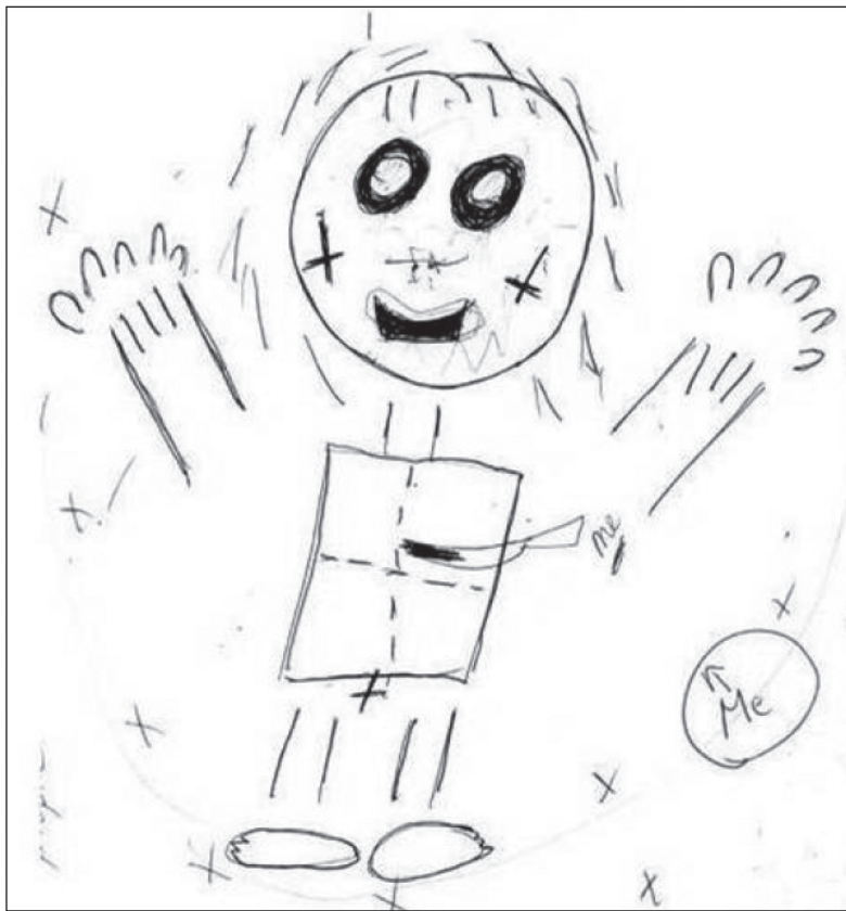
Fig. 3: Sara's drawing, 1995.

ers' bodily fluids, women sometimes believed this meant they had ingested evil. For example, LynneE believed the perpetrators' bodily fluids "collected like grapes" on her internal organs (Personal communications 2000-2002). Women needed to know their body biologically eliminated the perpetrators' bodily fluids.