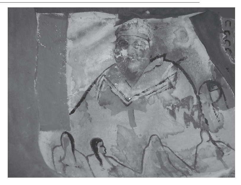
Lana Whiskeyjack, "Nohkom", mixed media (plaster, acrylic, colour photocopy, hide, gem and pastels), 2002.

Summer ended I started school with a smile she said "Education is your tool" then off we'd walk half a mile or so chewing gum, spitballs flying down the bus aisle