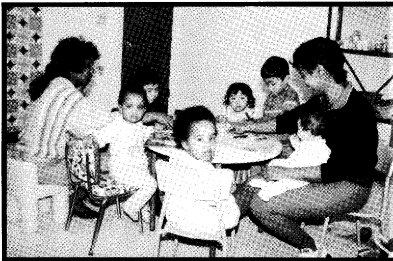
Play-school for refugee children in Calgary

dence that in contrast to men, women felt less psychologically marginalized because a majority of them had successfully re-established many aspects of their family lives that had always been central to them prior to coming to Canada. There was considerable evidence for this thesis. Married women had higher scores than those who were single, although it should be noted that this was equally true for men. In addition, household-based activities in the domain of women in Vietnam (like cooking, cleaning, and tending children) remained predominantly women's