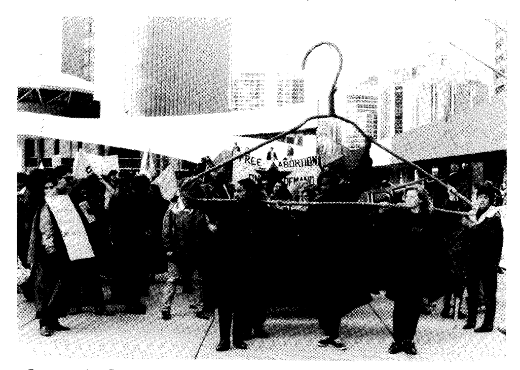
OCAC Demonstration, February 10, 1990

Star) of a self-induced abortion. Abortion is restricted and under attack by governments and right wing forces around the world who have targeted it as a symbol of women's emancipation. And it is women of colour and working class women who are most often at risk when access to abortion is restricted. For many years, women of colour have been raising concerns about the inclusion of their perspectives in the abortion rights movement. "The right to abortion can be a woman's right to life" said the Third World Woman's Committee of the Abortion Action Coalition in 1977 (Smith 86). The crisis of access and the campaign for choice