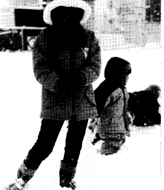
"I have to tell myself life goes on and we must live."