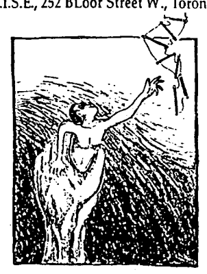
For all mental health professionals, educators, artists from all areas, interested individuals

15th Annual Conference October 22, & 23, 1994 O.I.S.E., 252 BLoor Street W., Toronto