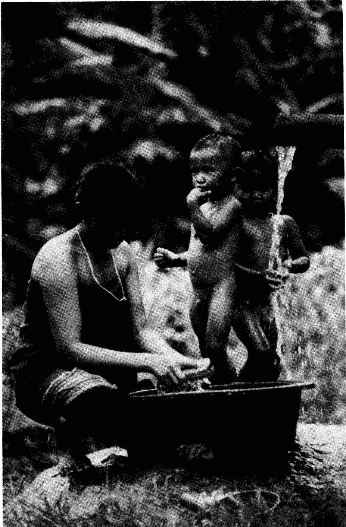
Mother and sons, rural Thailand