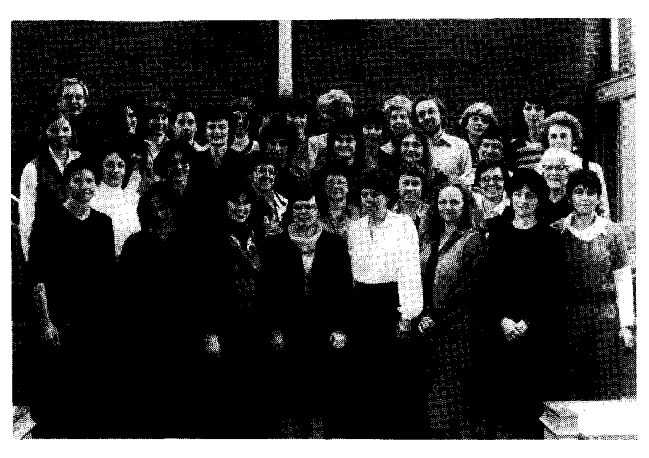
"Founding Mothers of caaws," 1981

roots CAAWS lie in the consistent underrepresentation of women in all facets of sport that has left women mute and frustrated. That all these women, and so many more, have succeeded, borders on the miraculous because Canada's sport system,