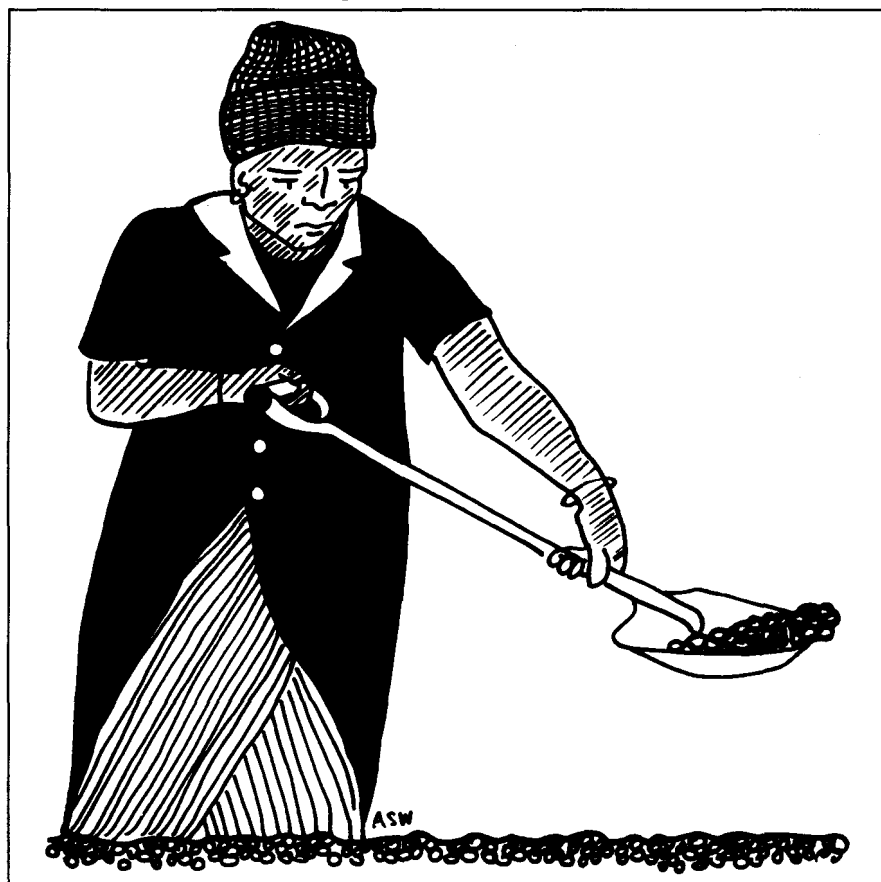
Reproduced by permission of the International Women's Tribune Centre. Artist: Anne S. Walker

Yet the consequences for micro and macro policy planning are immense. While dung can be a replacement fuel for scarce wood, and therefore ease the rate of deforestation, this use is a major loss in terms of soil conservation and fertility. For example, it is estimated that in Nepal eight million tonnes of dung are now burnt each year, equivalent to one million tonnes of foregone grain production (World Bank). At the same time, the use of dung as a fuel is a major instance of import substitution, and is a national saving in terms of the debts that would be incurred through the importation of fuel if resourceful women had not processed the alternative.