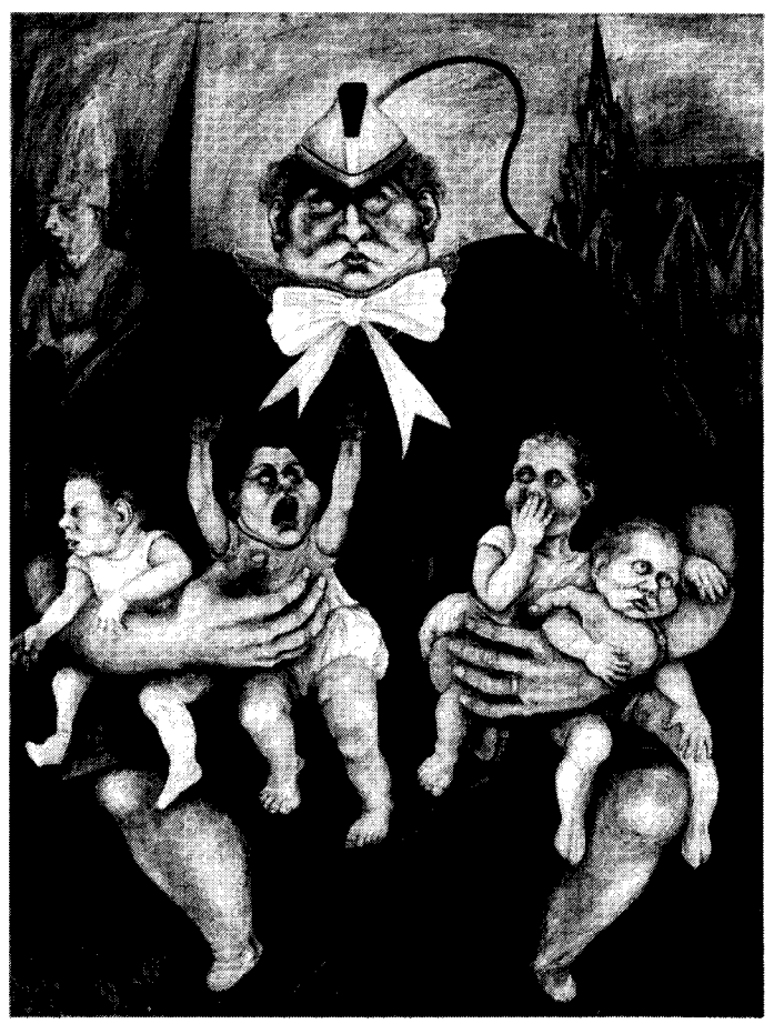
Rita Duffy, "Mother Ireland," oil on gesso panel, 1200 x 900 cm, 1989.

This was a theme that could be used to pro-feminist effect