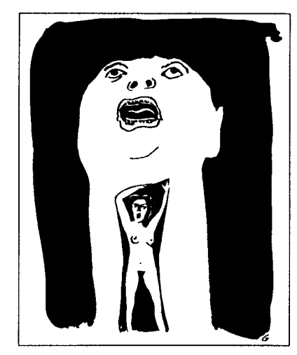
Gail Geltner, Untitled, 1985

The concept could be normalized and space created for learners to notice when they are less present and what is contributing to it. Do they have crises happening in their life? Are they having nightmares and trou-