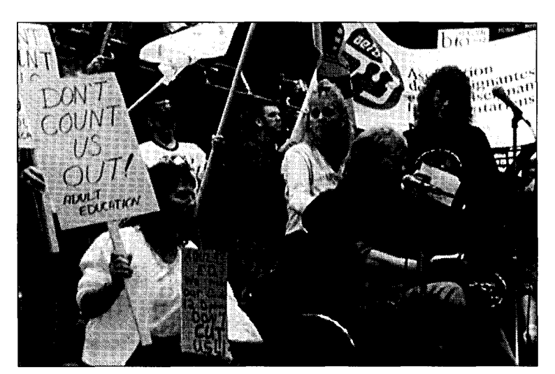
Education Rally. North Bay, Ontario, September 26, 1997.

One measure of the distribution of resources in our