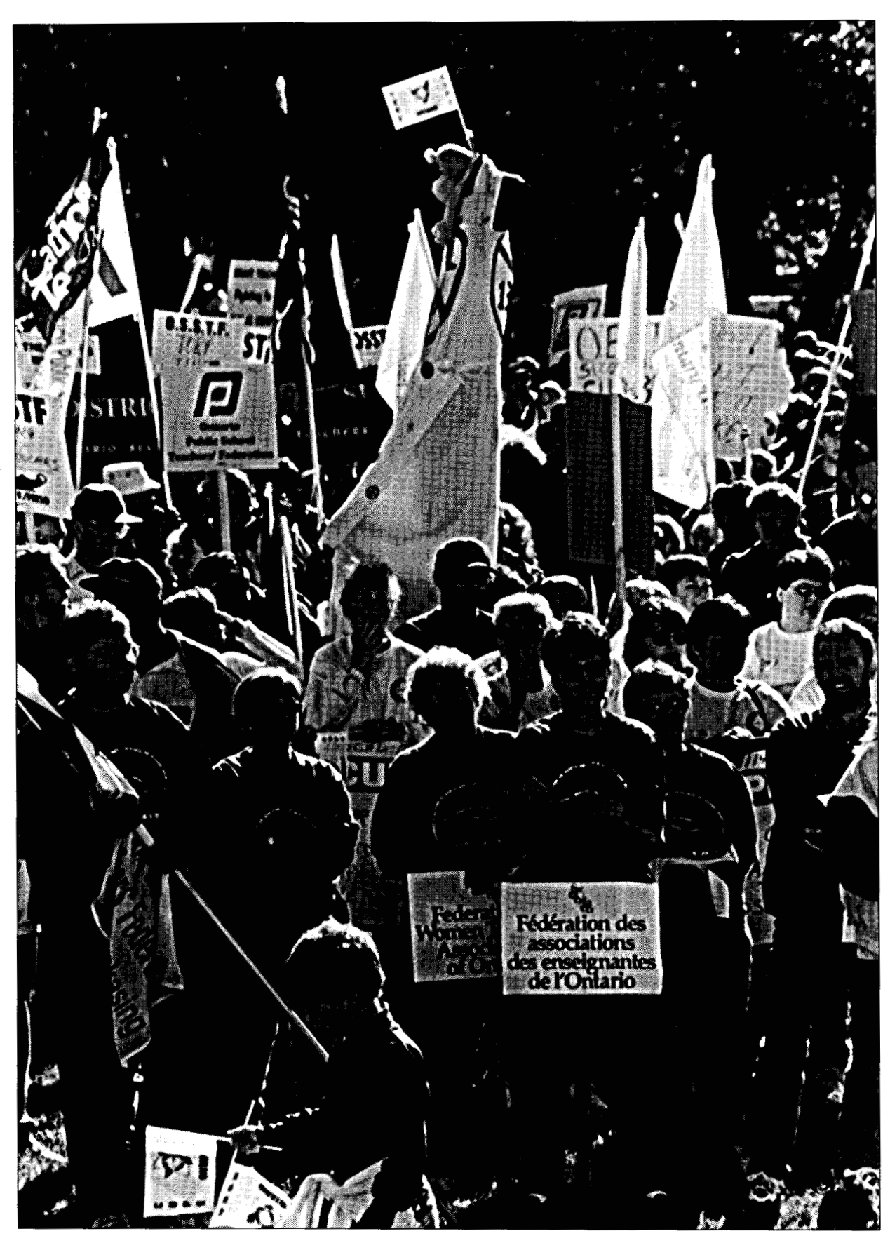
Days of Action of Rally. North Bay, Ontario, November 27, 1997.