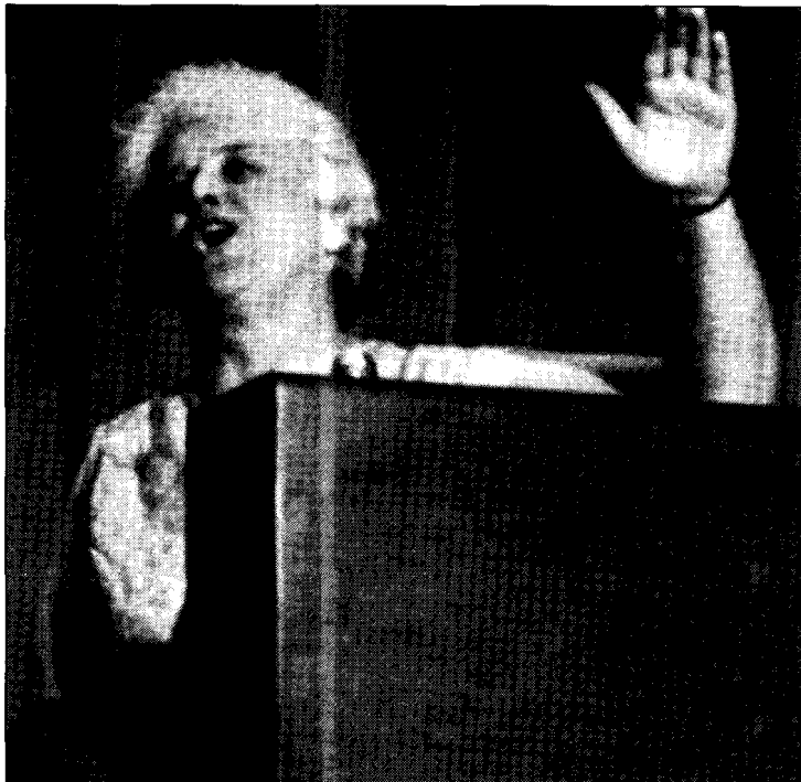
Originally published in CWS/cf Volume 1, Number 4, Summer 1979.

sacrificed for the greater glory of David Crombie, who is now electioneering in a district where very few prostitutes can afford to live. Of course, many of their customers and quite a few of their employers live in Rosedale, but, like the pimps, none of these have been much affected by the clean-up. They are simply riding out the whole elaborate hoax while they use the time to look for premises and