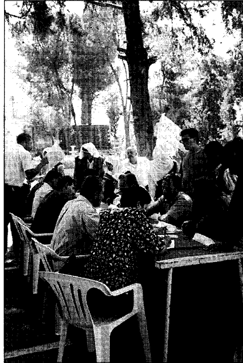
Occupied East Jerusalem, 1994. The Palestine Human Rights Information Centre hosted a "House Demolition Registration Day" to register the names and locations of those whose houses had been demolished or were threatened with demolition.

homes. In some situations, such as in the Occupied Palestinian Territories, the threat of forced eviction provokes intense anger and a sense of injustice which then fuels active resistance. Sadly, in the face of active resistance to eviction by women, the military will often use increased force