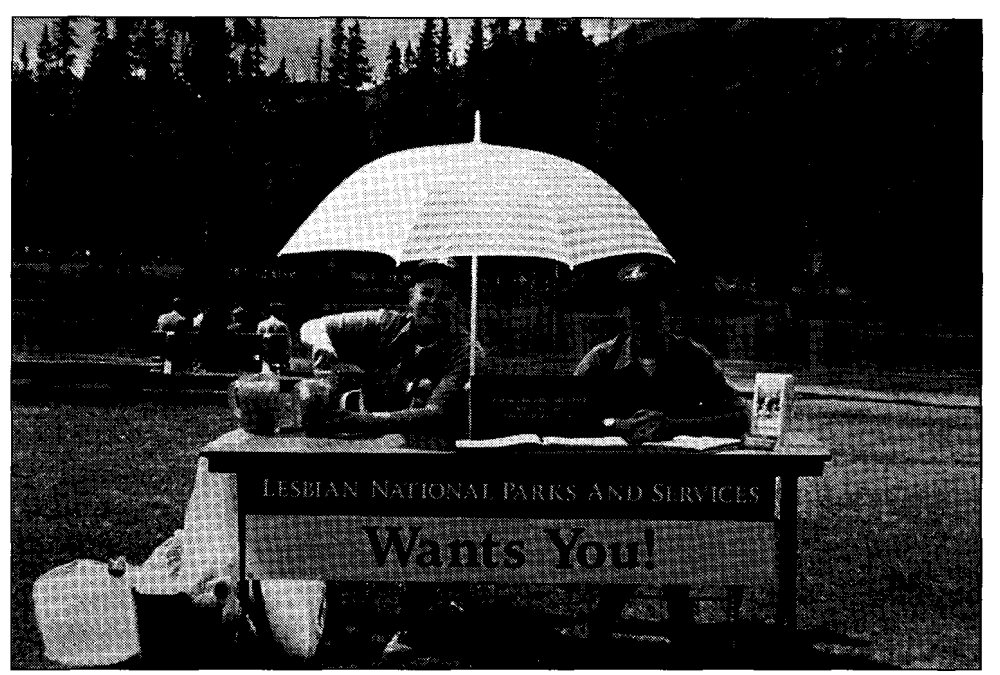
Lesbian National Parks and Services recruitment day in Central Park, Banff. Performance Piece by Shawna Dempsey and Lorrie Millan, 1997.

a century as a kind of natural museum, in which mountains and trees function as testimony to the past ... as display objects in a museum without walls whose vistas commemorate the territorial triumphs of the land's founding fathers.... (14)