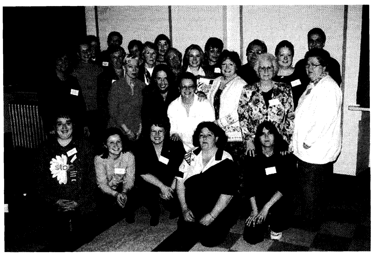
Members of Women Organizing Activities for Women (WOAW) presented with an award for their community development work from Promotion Plus, a BC sport organization that promtes gender equity in sport and physical activity.

ments now have community development agendas, there is an opportunity to connect with low-income populations, to foster their contributions and involvement in equitable community recreation organizing, and to strive towards a vision of social justice.