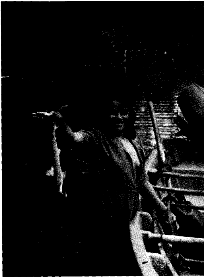
Coop members showing the fish catch.