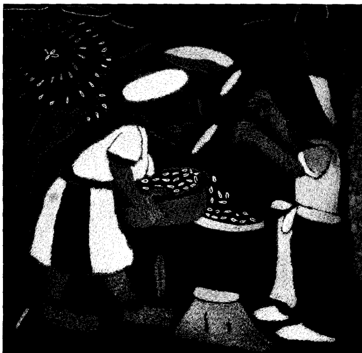
Wall-hanging, Earth Summit in Johannesburg, South Africa, 2002.