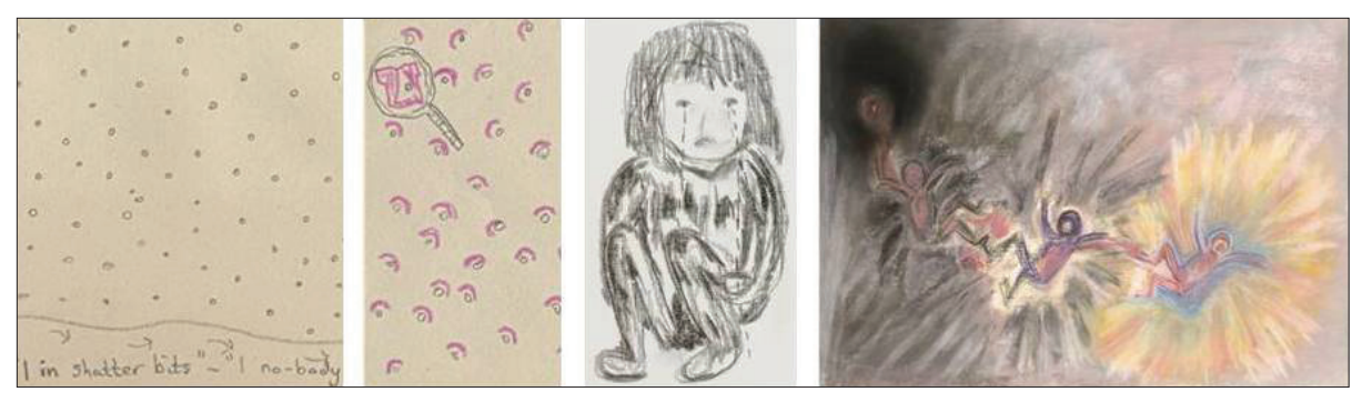
Fig. 4: "Shatter Bits," "Little Goodness Coat for my Shatter Bits," "Age Four," and "Crash Landing."

there," to experiences such as Carrie describes: "I went into my black hole where I couldn't hear a sound and if I could feel I went even further into the big black hole" (Interviews 1999). We suggest that these responses are normal survival coping mechanisms.