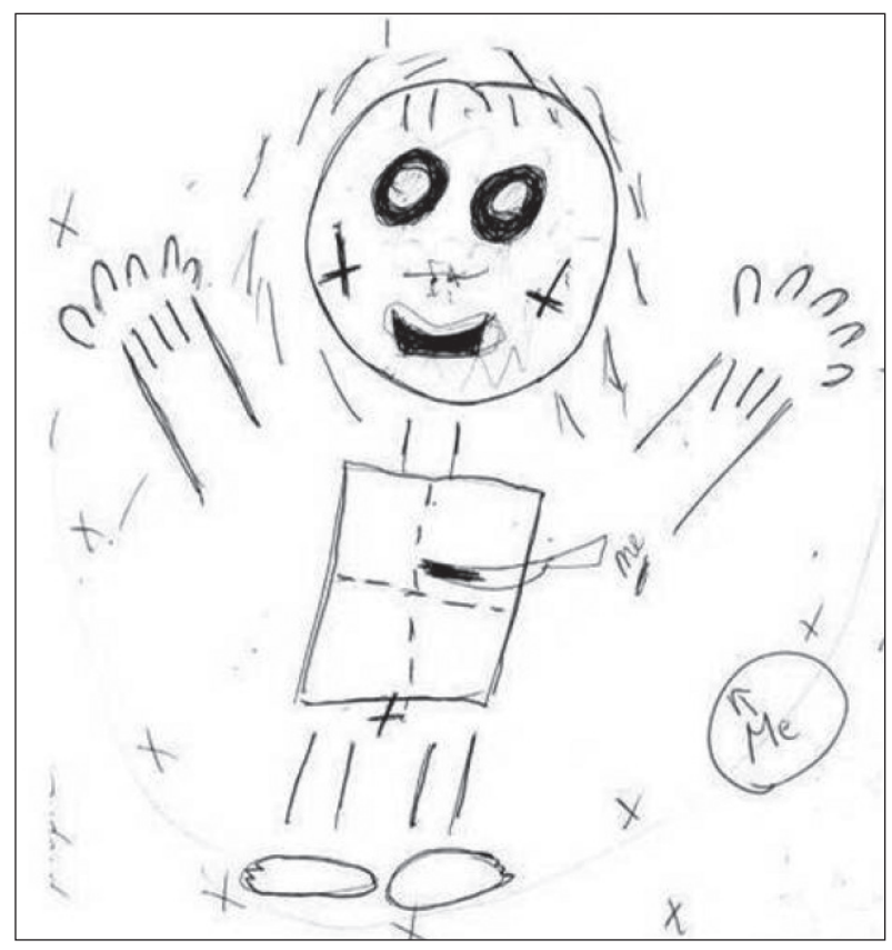
Fig. 3: Sara's drawing, 1995.

ers' bodily fluids, women sometimes believed this meant they had ingested evil. For example, LynneE believed the perpetrators' bodily fluids "collected like grapes" on her internal organs (Personal communications 2000-2002). Women needed to know their body biologically eliminated the perpetrators' bodily fluids.