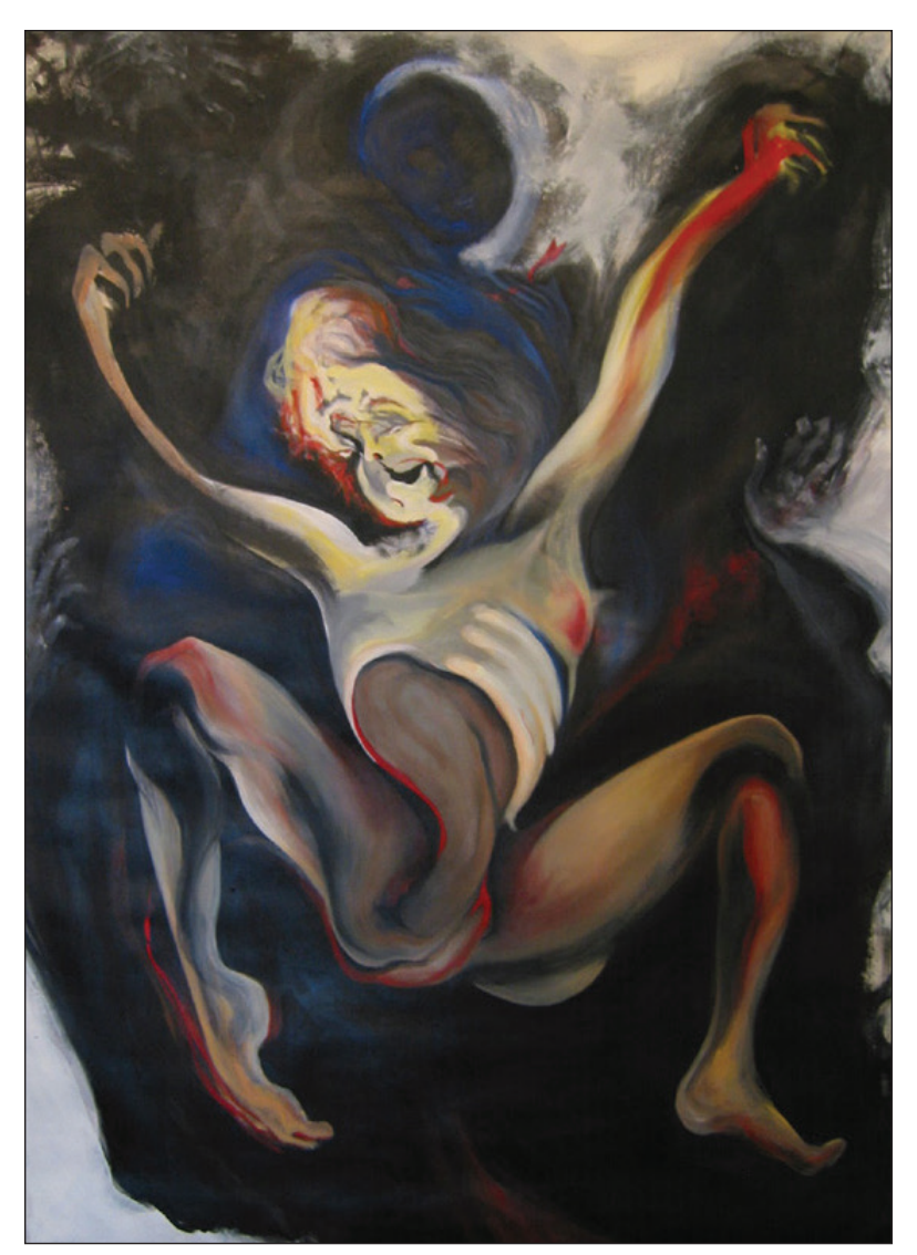
Fig. 2: Lynn Schirmer, "Rite of Passage," @1993, acrylic..

f ) Humiliation and dehumanization tortures included forced nakedness,