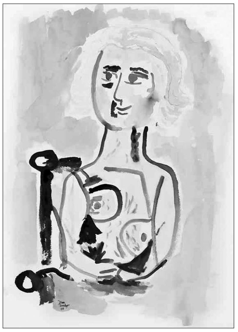
Diane Driedger, "Breast Cancer Picasso," 2008, watercolour, 17.5" x 26.5".