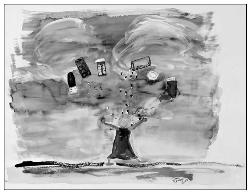
Diane Driedger, "Pennies from Heaven," 2008, watercolour, 21" x 24.5".