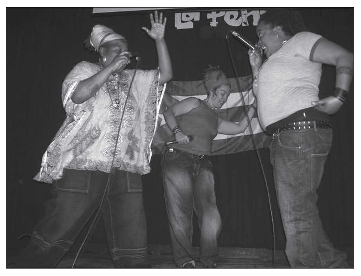
Las Krudas performing.

able to honestly reflect upon and question women's true position in Cuban society.