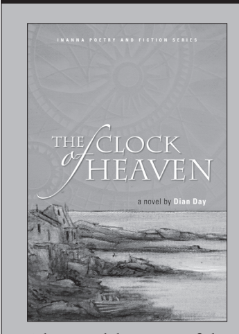
Silver Medal Winner of the 2009 IPPY Awards for Literature