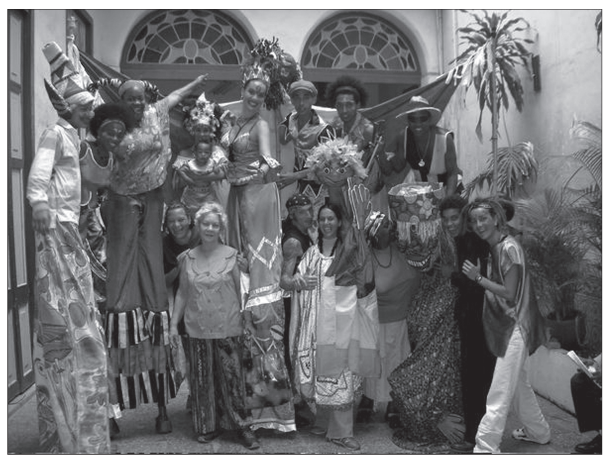
Las Tropazancos Cubensi in Havana, Cuba.

which I need to give my feminist yell and oration, my manifesto Krudas. It's the intensity, the force, it's also the accumulation of poetry with percussion, with force, with the voice of the people together. (Las Krudas 2007)