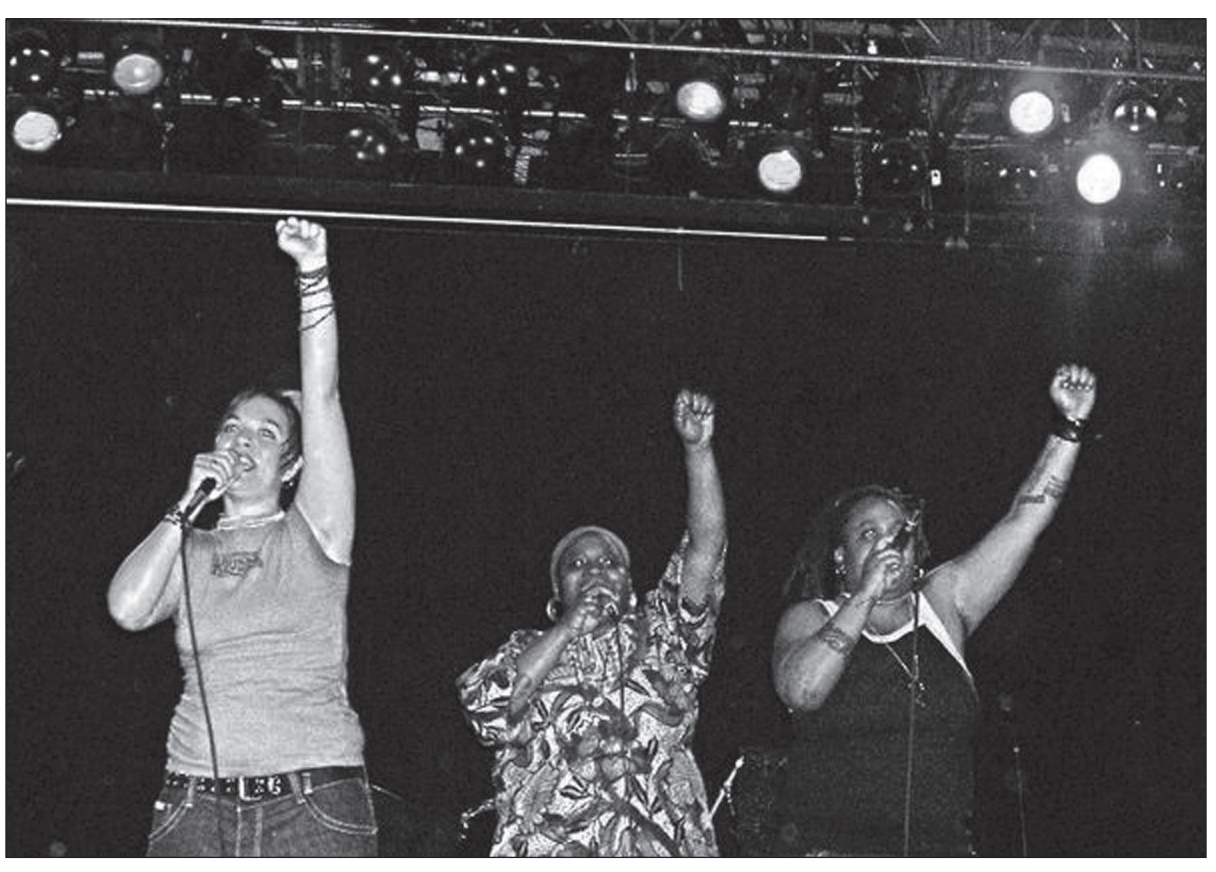
Raised fists at a Las Krudas performance.