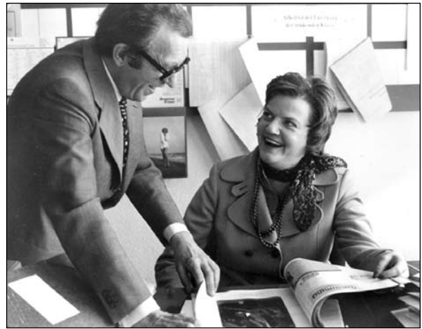
Researching Unfinished Revolution in Germany, c.1990.