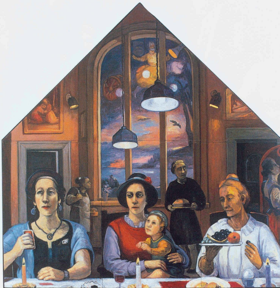
Fig. 8. Diana Dean, "Supper III," 70.75" x 69.25", Oil on Canvas, 1994.