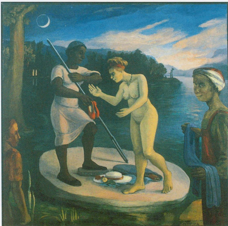
Fig. 10. Diana Dean, "The Eye of the Needle," 60" x 60", Oil on Canvas, 1997.