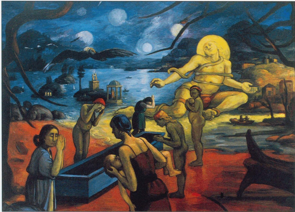
Fig. 6. Diana Dean, "Lamentations," 66" x 90", Oil on Canvas, 1994.