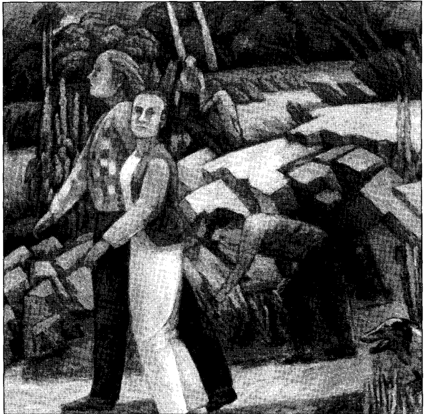
Figure 2. Diana Dean, "The Walk," 54" x 54", Oil on Canvas, 1984.

These paintings reflect changes that had taken place in