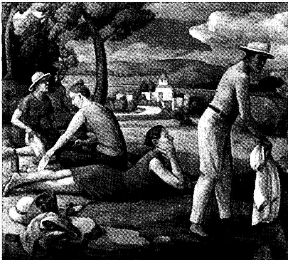
Fig. 4. Diana Dean, "Picnic Near Agnes," 60 "x 66", Oil on Canvas, 1988.

"Seven Stages of Women," 1999 (48 x 84") (Figure 1), appears to be a painting in which Dean plays most, if not all, the leading roles. The scene is one of several women of different ages at a social function. To the right of the picture, a teenage girl appears to be flirting with a man, as she begins her sexual and social development to adulthood. Behind her is a seductive woman (Dean) in a stunning coral dress, with a man in a tuxedo beside her.