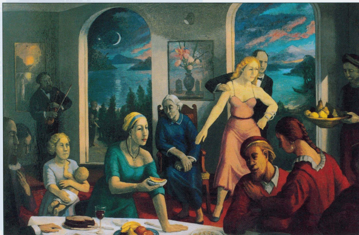
Fig. 12. Diana Dean, "The Seven Ages of Women," 48" x 72", Oil on Canvas, 1999.