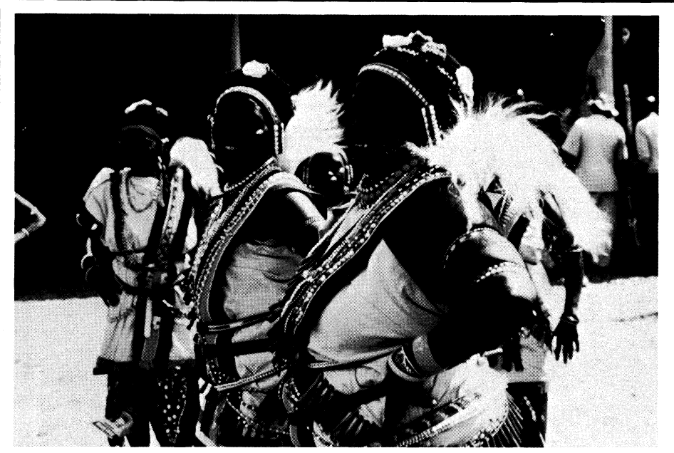
Kenyan Dancers at Forum '85