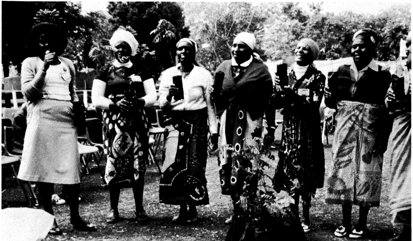
Green Belt Women's Dramatization of their Work