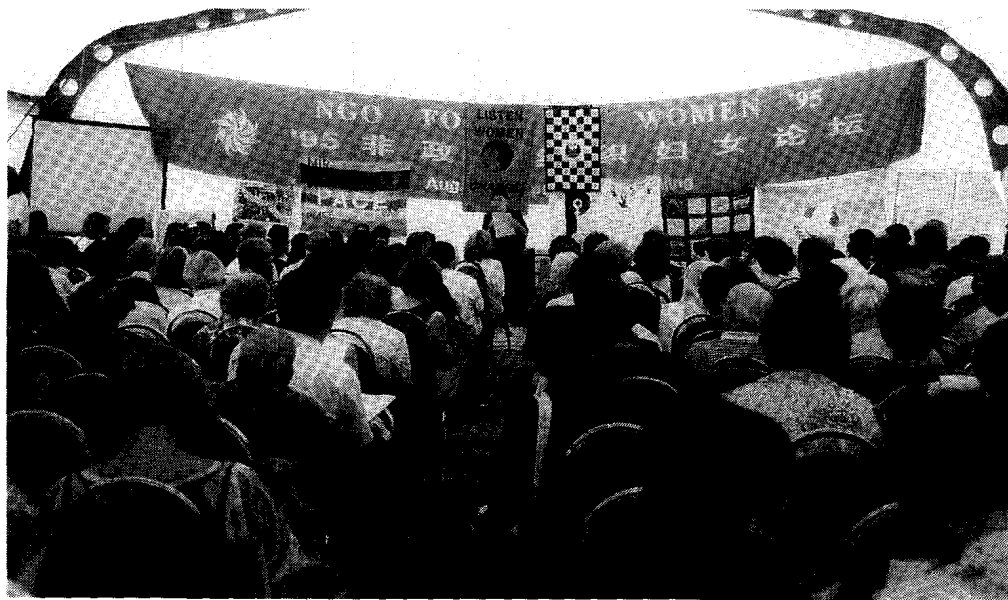
Women working for change, Peace Tent, ngo Forum 1995, Huairou.

Le présent article est issu d'un discours présenté au sein des dîners-conférences Bread and Roses de la Journée internationale