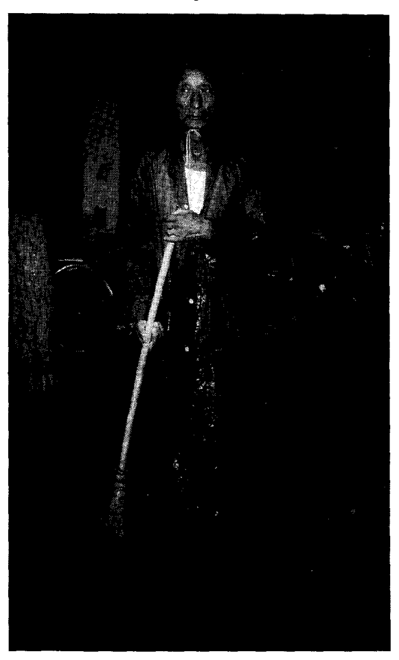
Chinese woman Huairou 1995.

that they are considered a little bit old, over 35, and their educational level is not high enough compared to men. They might only have junior high school whereas men have a better education. The women don't have any special skills, anybody can do the job, and so they get laid off. They also get laid off in favour of the influx of people from rural areas which provide cheap labour. Some new busi-