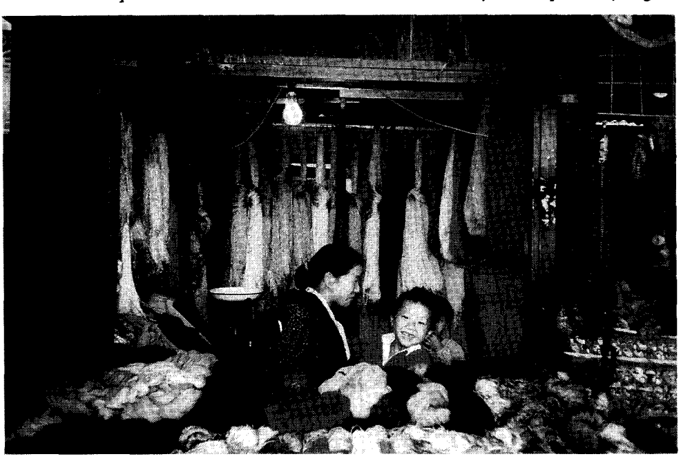
Mother and child, Beijing 1995.

sues. In China, at least before "opening up" to western markets, what was most important, whether you were a man or a woman, was your political stance. If you were politically "right"