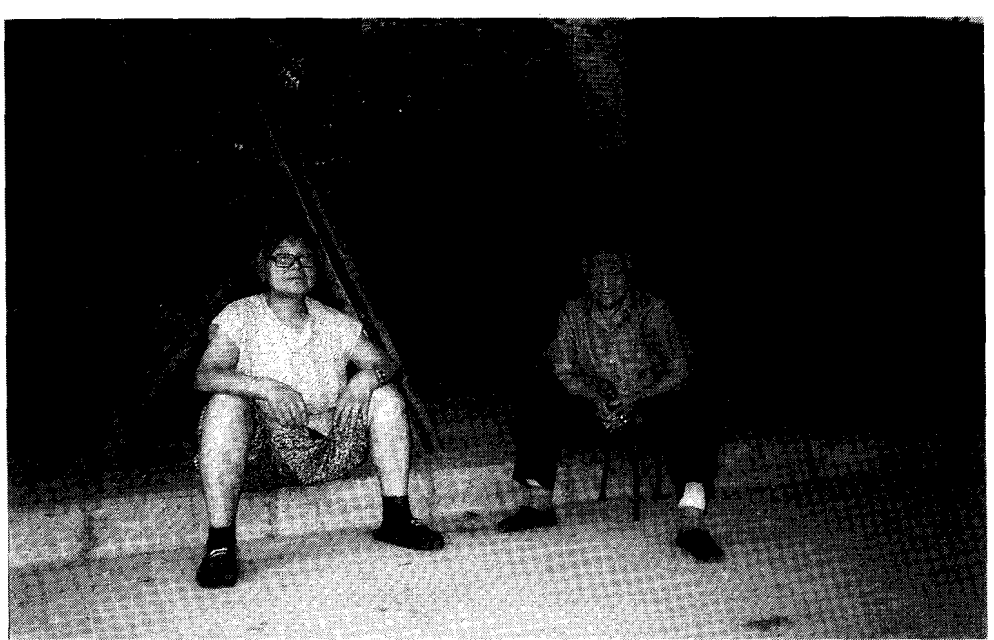
Chinese women, Beijing 1995.