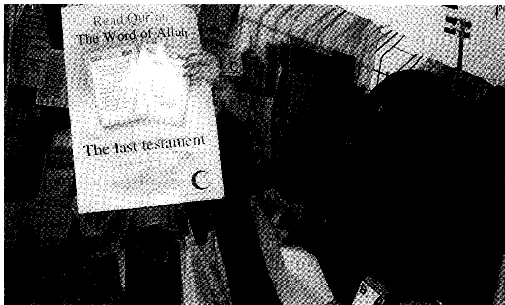
Fundamentalist women from Iran. NGO Forum '95.

The eye-opening and moving impact that the Iranian women (like most other delegations) experienced during the Beijing Conference shall inevitably contribute to the further growth of the reformist, feminist, and secular tendencies within and without them in Iran. Perhaps it was exactly out of the fear of the enlightening and empow-