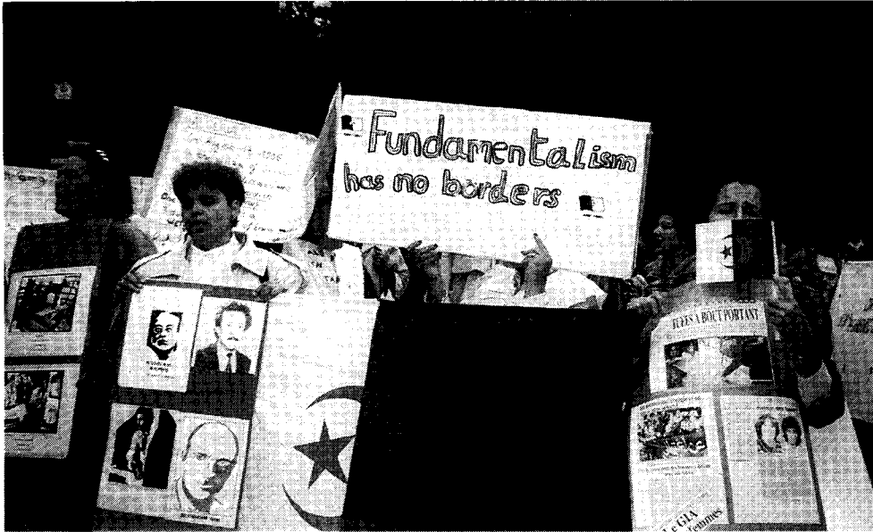
Anti-fundamentalist demonstration by Algerian NGOs and others. NGO Forum '95.

As an Islamic right and a human right of Muslim women, we demand from the respectful heads of state to employ competent and strong women to ministerial positions. In principle, it is more appropriate for those ministries that deal with many women clients or women-related issues to be headed by women ministers. Given the present performance of gentlemen in our ministries, it seems that the situation cannot get any worse than the way it is now by letting women govern. In any case, dear and respectful President of the Islamic Republic, Mr. Hashemi Rafsanjani, it is not too late yet to bring about a courageous and revolutionary change in the administrative system of our country. At the threshold of the birth of the Muslim woman into