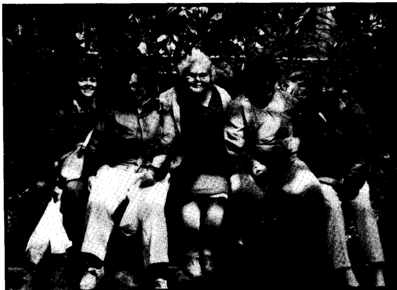
East End Literacy Women's Group