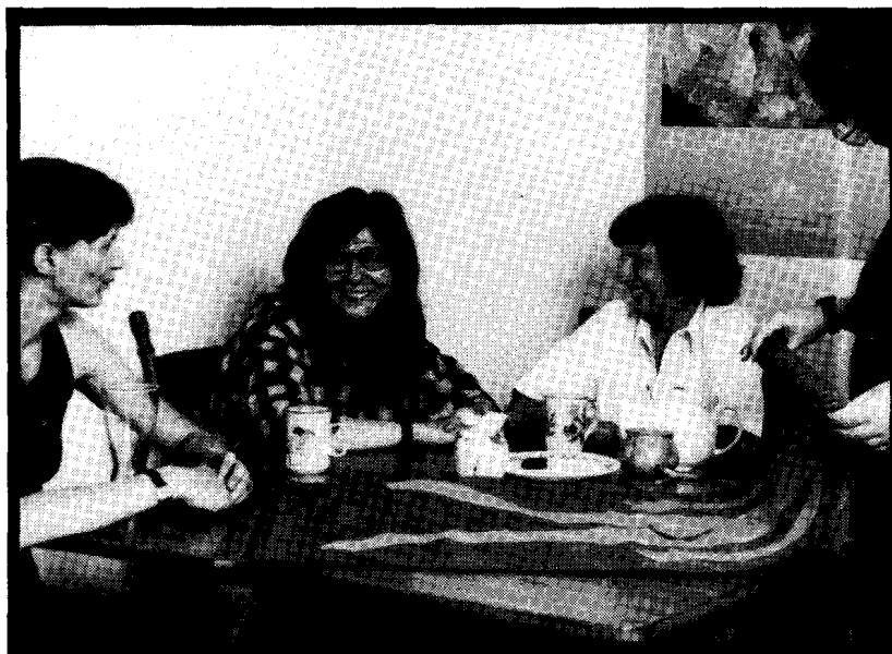
During photo-shoot of "I Call It the Curse!"

We do not know how to measure the learning that took place in the women's group. We hope that we have shown in this article why, sometimes, it is important not to try to measure, but rather first to listen, and to understand, and then to tell what happened.