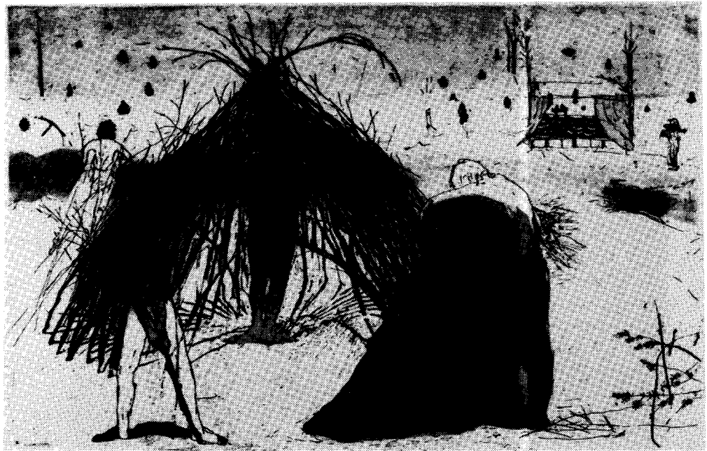
The Bride's Lament, (etching, aquatint).