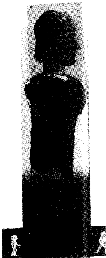
I Accuse, (etching, aquatint, drypoint). (One side of the Twin Monster Mirja Vänni)

How to combine a bread factory floating on a lake, its furnace spouting visionary leaves that stick to the palate and a mansard temple studio with russet Helsinki taxi drivers from the '50s for caryatides. Ingredients: cardboard, spangles, fluff, and lovely wet mud mixed with vast quantities of spittle. Just braiding and brushing, smoothing and drilling. The result: a seamless, rickety space, and oh what a fragrant surprise! When it glides into the canal, cabbies flock to the deck, accordions in hand, and O. Heiskanen rests in a four poster bed under the mansard roof, waving a banner that reads: THIS IS NOT A FAIRY STORY. Mirja and Vänni flaunt their shiny bakers' caps, and languidly raise their floury palms in salute, while Pekka hovers in the air, a seagull with a Holy Host in his beak.