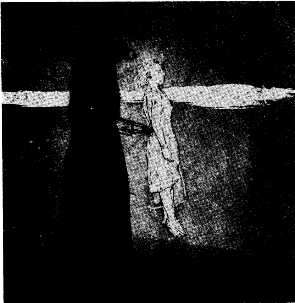
The Dream, (etching, aquatint, mezzotint).