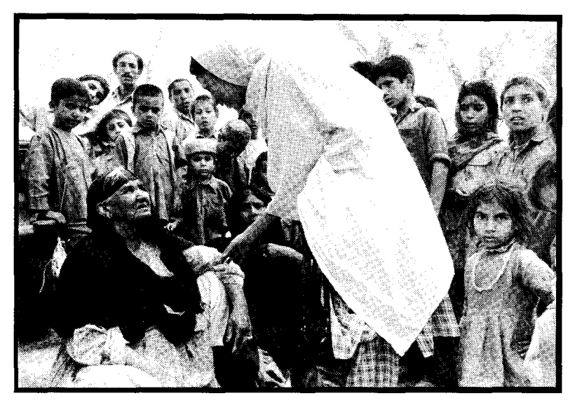
Afghan refugees in Pakistani camp

and psychological vulnerability. In many refugee situations, a major problem is the inability of women to free themselves from their daily tasks long enough to attend to their own health needs. In some cases, traditional nutrition and sanitary practices are inappropriate, or impossible to follow in a refugee camp or settlement with a concentrated population. Cultural barriers may also restrict women's access to health care. In UNHCR's largest country program, difficulties have been experienced in bringing medical and nutritional care to female Afghan refugees.