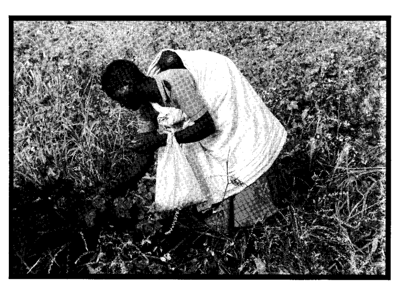
Mozambican refugee mother and child in Zimbabwe camp

proposed by the women themselves (such as girls schools, training of traditional birth attendants, improved sanitation facilities located at a safe distance from dwellings, introduction of farming activities and of semi-mechanized looms to supplement family income through traditional weaving skills). In societies where strong cultural constraints govern the role of women and their access to facilities, identifying and meeting the needs of vulnerable groups of refugee women can prove extremely difficult, as has been found to be the case in Afghan refugee