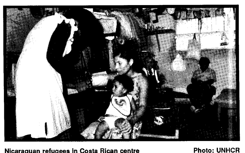
Nicaraguan refugees in Costa Rican centre

a prominent role in promoting the interests of refugee women. At the NGO International Consultation on Refugee Women held in Geneva in November 1988, the Canadian delegation consisted of seven women, three of whom are refugees now living in Canada. Refugee women at the Conference met with UNHCR's Deputy High Commissioner. The participants at the Consultation called on the international community, governments and voluntary agencies to change their "charity mentality" and recognize refugee women as individuals with specific needs who