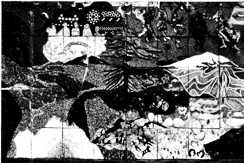
Goddesses Unite , Judy Springer, 1986, detail of 5' x 10' mural

and enforces the boundaries between us through oppressing one side of the division: lesbians/straights, women/men, black/white, poor/rich.... In my drawings I search for ways to remember the entire image, make visible the whole and claim all myself/ourselves.