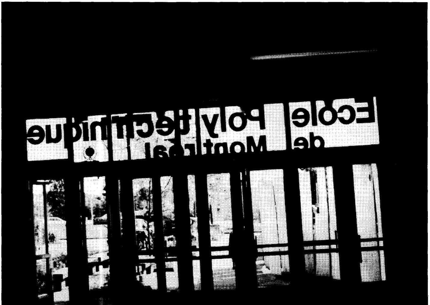
Photo by Elaine Carol from her performance "Marc Lépine thought he was a hero in a uniform" in Healing Images by a bunch of feminists, Toronto, 1990.

Healing Images was co-sponsored by CKLN, a Toronto community radio station.