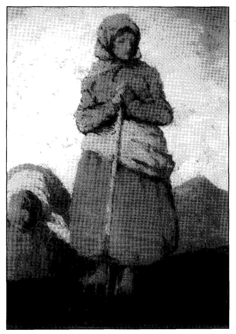
Figure 1: Paul Henry, "The Potato Diggers," oil on canvas, c.1912 Collection, National Gallery of Ireland

This paper explores how issues centring on landscape, space, and gender intersected with the construction of a new Irish post-colonial identity. In the decades following political independence in 1922 the image of Ireland and the Irish projected by successive governments was that of a bleak but beautiful countryside, peopled exclusively by