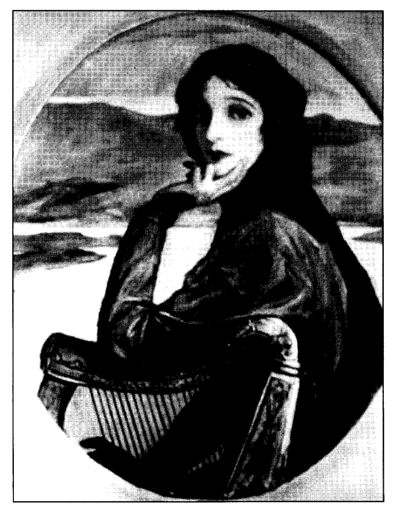
Figure 3: John Lavery, Lady Lavery as Kathleen ní Houlihan Courtesy of the Central Bank of Ireland

The homosocial bonding of nationalism required the exclusion of women from the body politic and structures were put in place to create a legal basis for this strategy. In 1925 a Civil Service Amendment Act, followed two years later by a Juries bill, sought to curtail and restrict the role of women in Irish public life. Examinations for positions in the civil service were limited on the basis of sex which effectively prevented women from moving ahead in their careers. A decade later a ban was introduced to prevent married women from remaining in the service. The Juries bill virtually ensured that there would be no women jurors. A Matrimonial Act (1925) outlawed divorce and a Censorship Act (1929) denied women access to birth control information. From 1934 the sale and importation of contraceptives was prohibited and the new 1937 Constitution made it clear that a woman's place was in the home. Article 41, section 2 stated "the State recognizes that by her life within the home, woman gives to the State a support without which the common good cannot be achieved."2 The image of the peasant woman in her rural habitat as painted by Keating, Lamb, and others provided a suitable