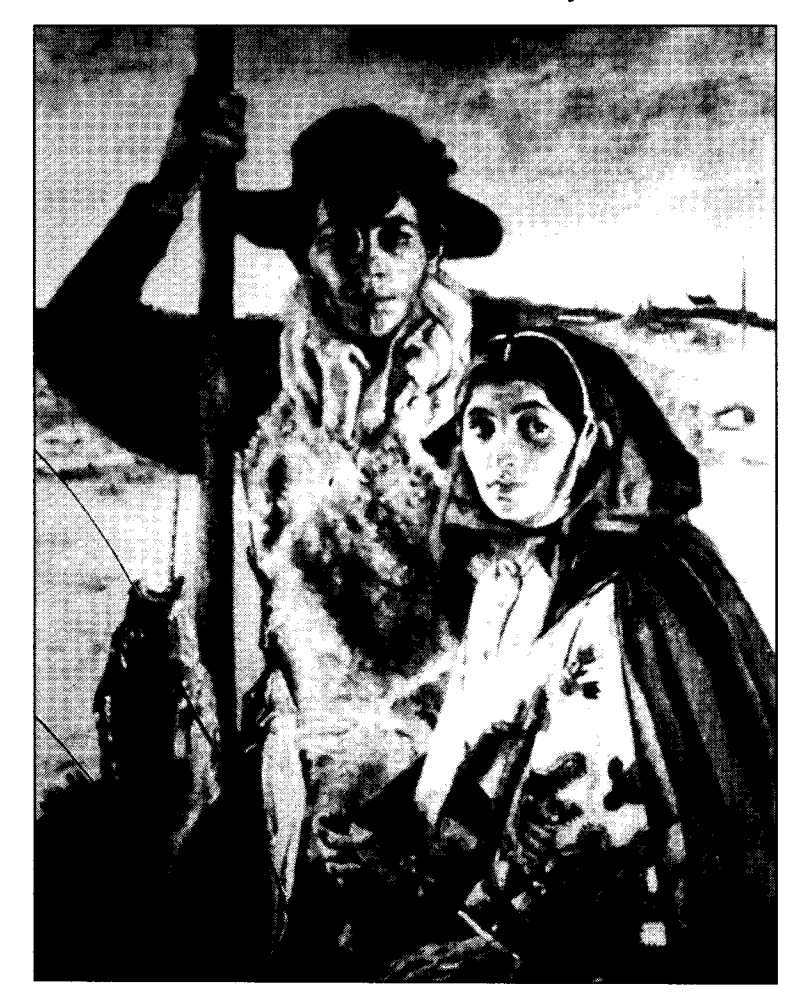
Figure 4: Sean Keating, "Aran Fisherman and his Wife" Collection, Hugh Lane Municipal Gallery of Modern Art, Dublin

Although Henry began by painting the activities of the peasantry, gradually his images became "pure" landscapes in which no human intrudes. The only references to the people who actually inhabited and worked the land, are in the turf stacks (turf was dug in the bogs, dried out, and then used to heat and cook) and in the depiction of traditional