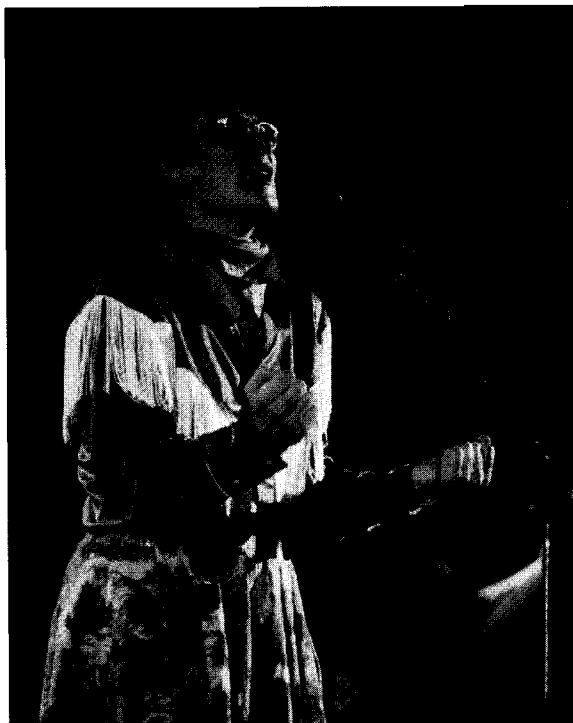
Figure 1: k.d. lang in August 1984 at the Edmonton Folk Festival

Although lang’s initial success was in country music, she refused to perform the identity of a typical country musician. When she first came to widespread notice in the mid-1980s, she was renowned for her quirky image, labelled “cowpunk” (see Figure 1). The cowpunk image included both her appearance—spiky hair, retro glasses (with no lenses), sawn-off cowboy boots, etc.—and her onstage antics as a performer, which were manic and mischievous. After travelling to Nashville to make her third album, Shadowland (1988), lang toned down her image and performance style somewhat. On the cover of Absolute Torch and Twang (her fourth album, released in 1989; see Figure 2) she posed in the middle of a wheat field with cowboy hat in hand: a traditional “country” image. But the short hair, together with her generally androgynous physical appearance and outfit, made her look more like a cowboy in drag rather than a cowgirl. As Judith Butler notes, butch identity “is neither some decontextualized female body nor a discrete yet superimposed masculine identity, but the destabilization of both terms as they come into erotic interplay” (Butler 156–57). lang’s “cowboy” image on Absolute Torch and Twang ,