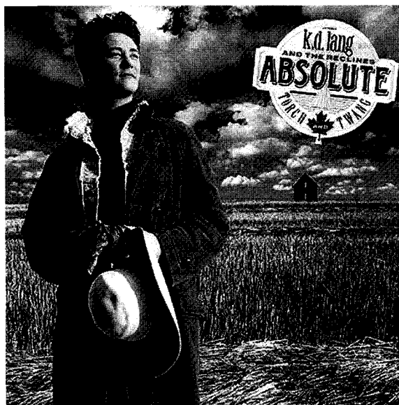
Figure 2: the cover of k.d. lang’s fourth album, Absolute Torch and Twang (1989)

released a year before Butler’s book, is a striking visual correlative of Butler’s interpretation of butch identity.